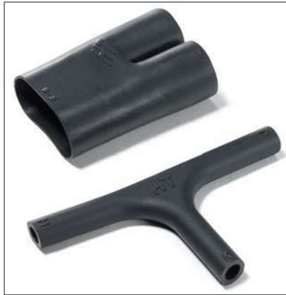
412H622-625 Series supplied / fully recovered.

This style provides connector cable strain relief and is used in conjunction with a circular grooved adapter.